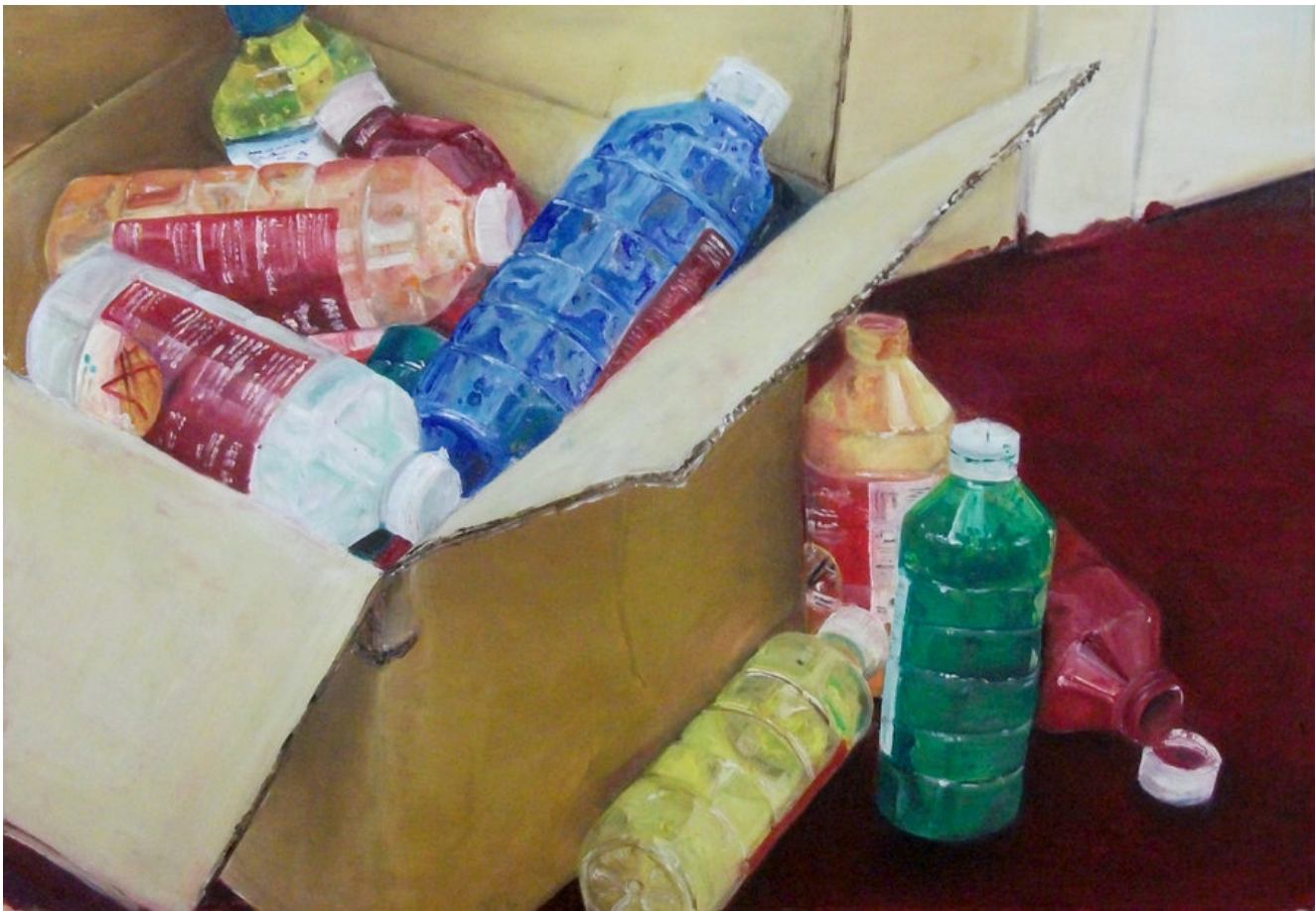
AP Art: This final piece of empty colored bottles illustrates the beauty of ordinary, discarded objects.

Then eliminate those topics for which the source material lacks aesthetic appeal. Do not mistake 'aesthetic appeal' for pretty . In fact, some of the 'ugliest' things can be stunningly rendered in an artwork or design. Art teachers (and artists in general) often speak of finding the beauty in the ordinary or mundane: seeing the magic in that which others have discarded or forgotten. This does not mean, of course, that any old thing is suitable for your AP Art topic. Some scenes are genuinely unattractive and unsuitable visually. Certain object combinations (due to their particular shapes, colors or textures) are extremely difficult to compose in a pleasing way. Similarly, some items – particularly disproportionate drawings or designs by others – are very challenging for a high school student to replicate. A drawing, for example, of a doll that is proportioned unusually, may appear to be an inaccurate, badly proportioned drawing of an ordinary doll. In other words, the examiner may not realize that the doll is proportioned badly – they may think you simply cannot draw. (If you find ascertaining the aesthetic potential of your ideas difficult, discuss this further with your art teacher.)