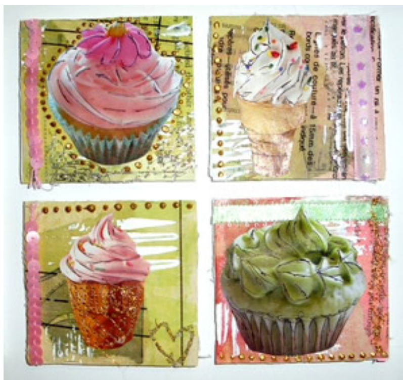
Sometimes even 'pretty' objects can be explored in a contemporary and innovative way, as in this appealing mixed media cupcake work by a student from Sir William Ramsay School.

In order to create artworks, you will need access to high quality imagery. For example, if you are exploring the way in which humans kill animals in order to consume their meat, access to the inside of a butchery or abattoir/freezing works is likely to be essential. Reliance on photographs taken by others is unacceptable. No matter how awesome a theme appears, if you are unable to explore any aspect of it firsthand, you will not be able to do the topic justice. Remember also that it is likely you will need to return to your source imagery several times during the AP Art course, so a submission based upon a particular plant that only blooms for a couple of weeks out of the year, or a view of your village during a rare winter snow storm, is very risky. The ideal AP Art subject is one that you can physically return to, whenever you need – to draw, photograph or to experience firsthand. Eliminate those which do not meet this criteria.