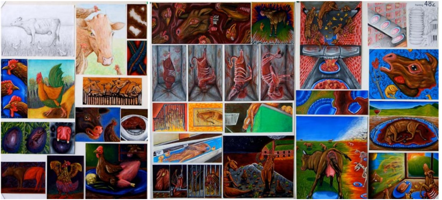
AP Art Ideas: This student has used provocative imagery to explore the contentious issues surrounding human consumption of animal flesh.