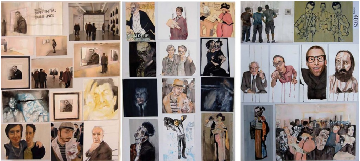
AP Art Ideas: This is an example of a tried and true portraiture theme being approached in a highly original and innovative way, exploring the interaction between artist and viewer.

Finally, ensure that the topic you choose is something that you really care about: something that can sustain your interest for a year. If you have more than one topic left on your list, pick the thing that you care about the most.