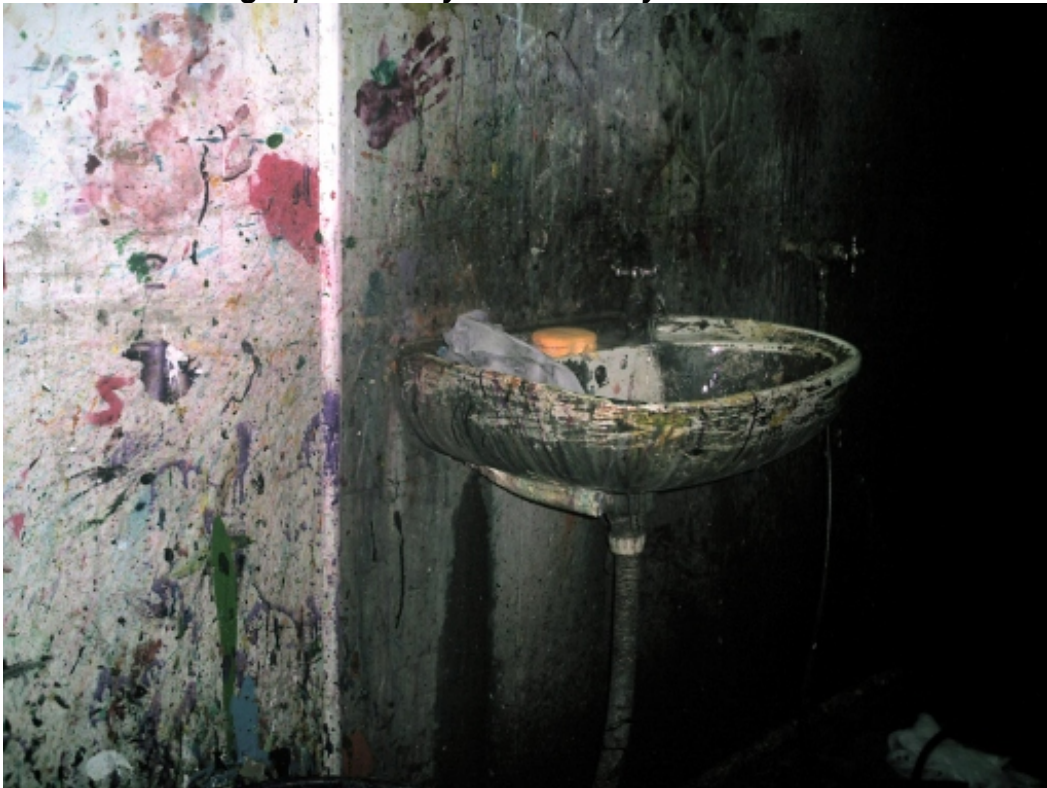
Photographic study of a sink by Aditi Kulkarni :